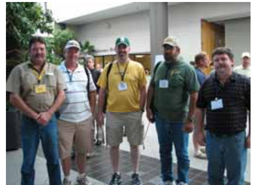
Above—L. to R.—Okay, Explain it to me again, Why did we have to get here so early??? - Guy in the back? No, you stay in the picture! - We said you'd make the newsletter and you did, but I can't believe we are using a picture with a guy in a green hat like that!