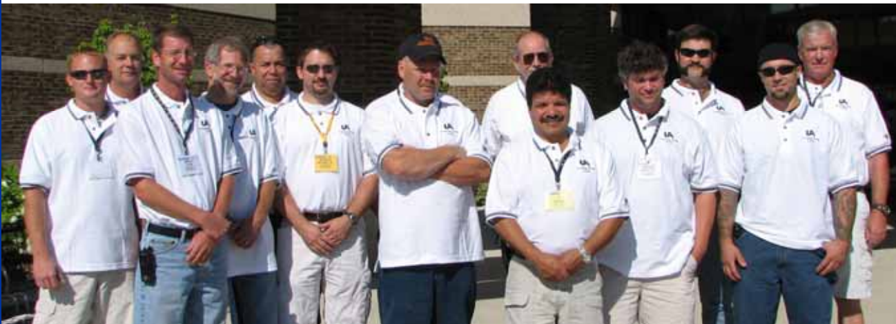
UA Local 190 Instructors