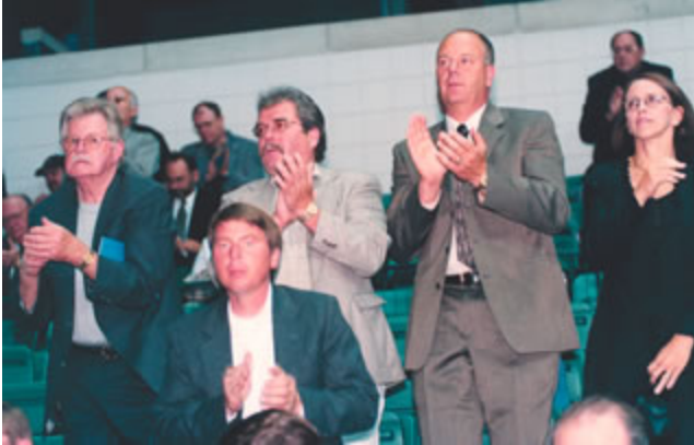
with UA General Presi

There was a significant crowd on hand to making this a most memorable graduation ceremony. Along