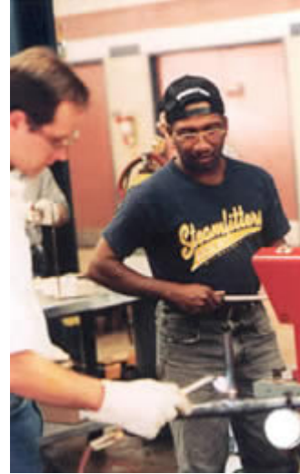
UA Welding Program