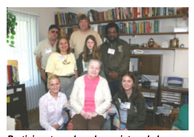
Participants and workers pictured above

As in the past, the morning began with a breakfast for all participants where they received their assignments for the day. The breakfast gives new volunteers the opportunity to learn from the "Old Timers" what the day should hold, and how to deal, the most effectively with the participants.