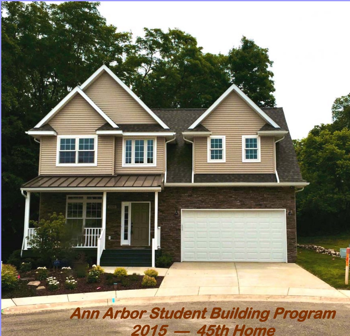
Ann Arbor Student Building Program 2015 — 45th Home

"I don't know what your destiny will be, but one thing I know: the only ones among you who will be really happy are those who have sought and found how to serve."