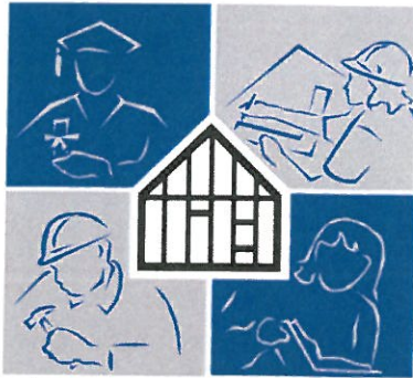
The Ann Arbor Student Building Industry Program

Throughout the forty years of the program, the students have built quality homes in some of the best neighborhoods in Ann Arbor. But the most important asset that comes from the program is not the homes -- it's the students.