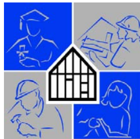
The Ann Arbor Student Building Industry Program

The Greater Michigan PMC is enormously proud of our involvement in this program over the past three decades, and we were honored to have had the opportunity to prepare and sponsor this years calendar highlighting the industry with the great program we have here in Ann Arbor.