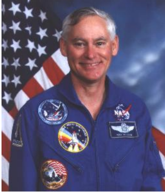
Colonel Mike Mullane, retired Air Force and NASA Astronaut was a special speaker on leadership for two schools in the Greater Michigan area.