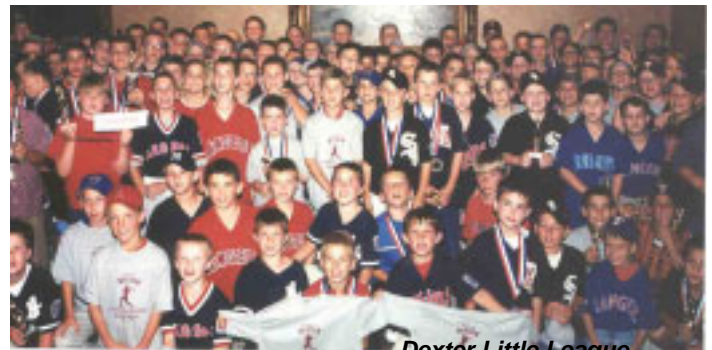
Dexter Little League