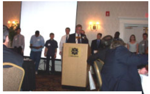
2003 Student Home Builder Participants Receive Awards

You can learn more about the Ann Arbor Student Building Industry Project by going to the website designed and sponsored by PMC: www.aastudentbuilding.com .