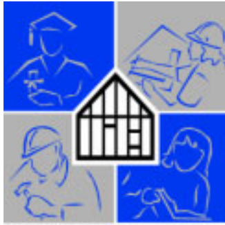
The Ann Arbor Student Building Industry Program