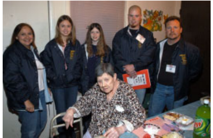
Pictured above – Workers and the Recipients